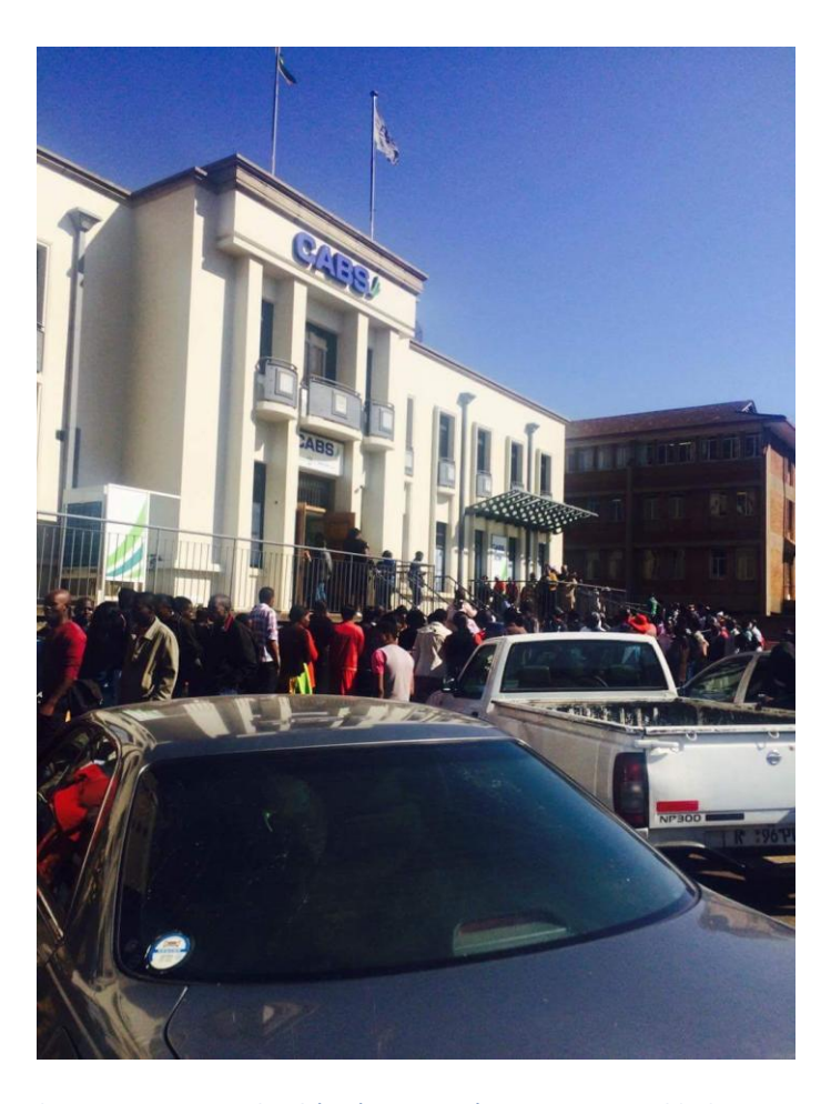
Citizens queuing at CABS bank in central Harare, August 2016, Harare

The health sector as a whole has been tragically affected by the deepening crisis; several referral hospitals in Harare have been forced to suspend surgical operations, due to the lack of essential drugs such as painkillers, anaesthetics or antibiotics in health facilities and pharmacies.<sup>56</sup> Patients often need to supply soap or even water buckets and to pay in advance – rigorously cash – to obtain the necessary treatment. "It has become an inescapable dilemma: if we spend our salary in drugs we can't afford to bring food to our table, if we buy food we can't save enough money for medicines" explains a patient who had to borrow $150 for a scan.<sup>57</sup> Finally, the rampant extortions of money and widespread bribery acts committed by police officers at illegal roadblocks, and the government recurrent failure to pay pensions and civil servants salaries on time