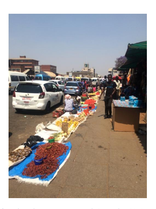
Informal vendors in Harare central, September 2016, Harare

influence in domestic politics.<sup>101</sup> How to reconnect social struggles and legitimate demands of socio-economic justice by Zimbabwean people to a broader political agenda remains, arguably, the main challenge ahead. How to reconnect social struggles and legitimate demands of socio-economic justice by Zimbabwean people to a broader political agenda remains arguably the main challenge ahead.