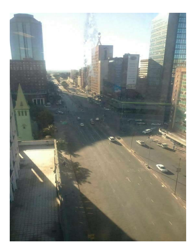
View of central Harare on national ShutDown day, 6th July 2016, Harare